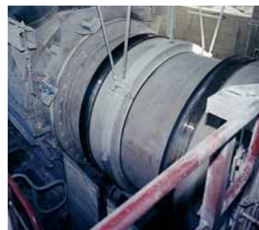
Twin Cooler concept in a Spanish white cement plant.

Recommissioning of the modernised plant is due to commence in the second half of 2006.